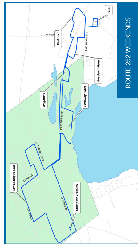
ROUTE 252 WEEKENDS

RTS Ontario connects to Wayne, Seneca and Monroe Counties through service with RTS. Regional Connectivity schedule information is available at myRTS.com or by calling 585-394-2250.